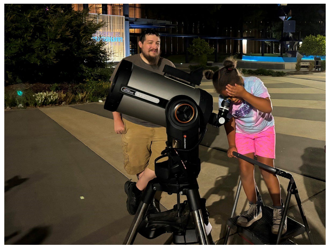
International Observe the Moon Night, September 2024.

NASA's Night Sky Network is one of the most successful and longstanding grassroots initiatives for public engagement in astronomy education. Started in 2004 with the PlanetQuest program out of the Jet Propulsion Laboratory and currently supported by NASA's Science Activation, the Night Sky Network (NSN) is critical in fostering science literacy through astronomy. By connecting NASA science and missions to support amateur astronomy clubs, NSN leverages the expertise and enthusiasm of club members, who bring this knowledge to schools, museums, observatories, and other organizations, bridging the gap between NASA science and the public. Now in its 20th year, NSN supports over 400 astronomy clubs dedicated to bringing the wonder of the night sky to their communities across the U.S. and connecting with 7.4 million people across the United States and its territories since its inception.