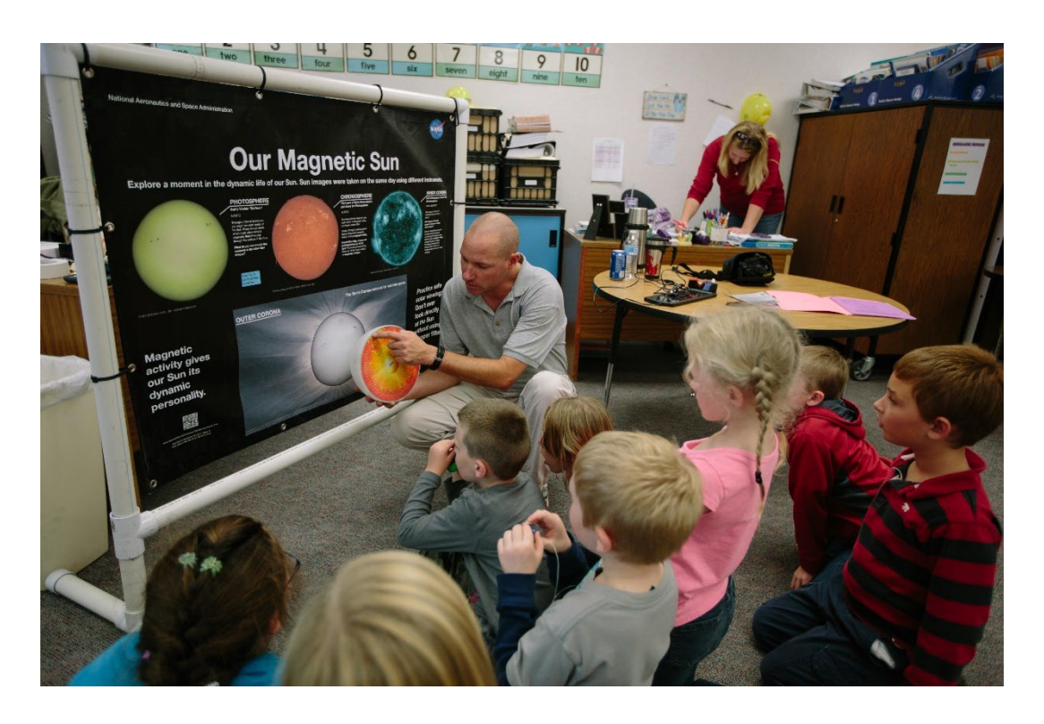
Rye Science Day, October 2014.

Outreach Toolkits were developed to assist clubs with their endeavors. These kits include educational materials, hands-on activities, and guides for explaining topics in an accessible way. So far, 13 toolkits have been created on topics ranging from the scale of the universe to how telescopes work. To qualify for these free Toolkits, clubs must be active in their communities, hosting two outreach events every three months or five outreach events within a calendar year. Supplemental toolkits were also created based on special events like the solar eclipses and the 50th anniversary of Apollo's Moon landing. A new toolkit is being developed to teach audiences about solar science, and NSN is on track to support clubs well into the future.